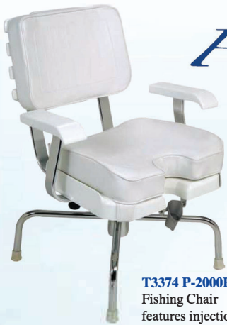
T3374 P-2000F Fishing Chair features injection