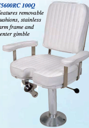
T5600RC 100Q features removable cushions, stainless arm frame and center gimble

molded engineering grade structural resin components, aluminum frame and center gimble. Also available with teak backrest and arm pads.