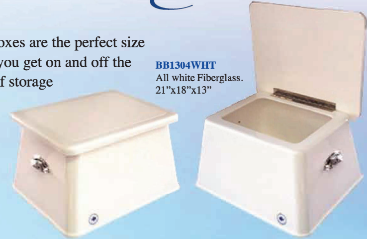
BB1304WHT All white Fiberglass. 21"x18"x13"

Pompanette step boxes are the perfect size and height to help you get on and off the boat. With plenty of storage room inside, these boxes are the ideal option to hold shoes, cleaning supplies, ropes, etc.