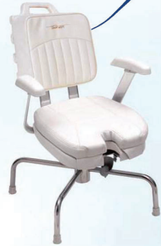
THV2000F Pro Series Fishing Chair features polypropylene components, aluminum frame and center gimble.