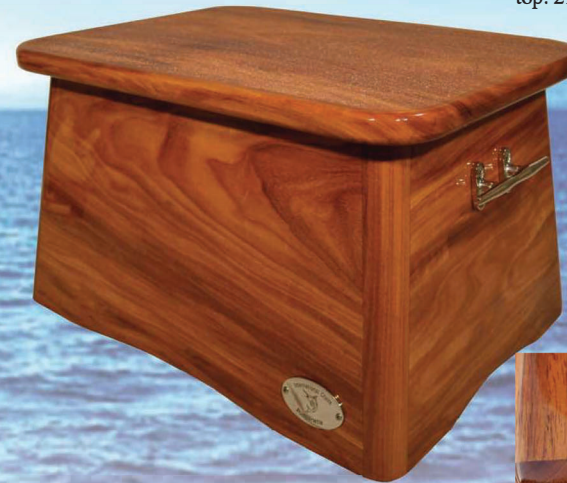
BB1304-TEAK All white Fiberglass with natural or varnished teak accent top. 21"x18"x13"