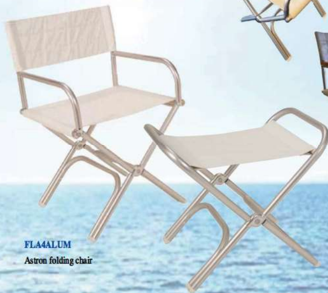
FLA4ALUM Astron folding chair