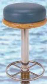
TPC-34-385 Cake Top Teak. Upholstered seat with teak accent bottom. Fit's both 2 7/8" and 4" stainless pedestals