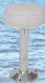
T2865000 Cake Top. Upholstered seat w/ starboard core. Fit's both 2 7/8" and 4" stainless pedestals