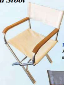
FLA4ALUM-T Astron folding chair with natural teak arm supports.