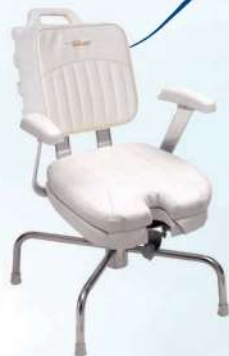
THV2000F Pro Series Fishing Chair features polypropylene components, aluminum frame and center gimble.

molded engineering grade structural resin components, aluminum frame and center gimble. Also available with teak backrest and arm pads.