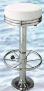
TPC-34-355 Premier Series Barstool. Upholstered seat with stainless ring frame. Fit's both 2 7/8" and 4" stainless pedestals