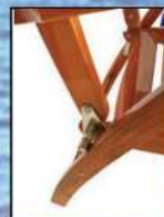
Stainless hardware and fasteners

4079-6003 5-Position Recliner in high gloss.