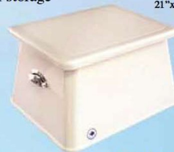
BB1304WHT All white Fiberglass. 21"x18"x13"

Pompanette step boxes are the perfect size and height to help you get on and off the boat. With plenty of storage room inside, these boxes are the ideal option to hold shoes, cleaning supplies, ropes, etc.