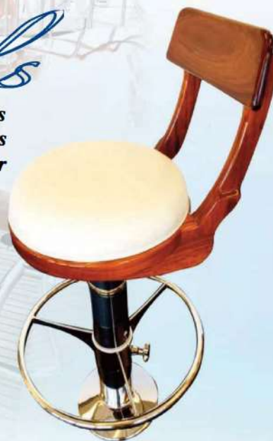
T7023THB Teak High Back Barstool. All teak w/ choice of fabric Fit's both 2 7/8" and 4" stainless pedestals