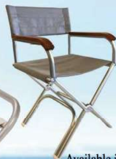
Available in finished high gloss.