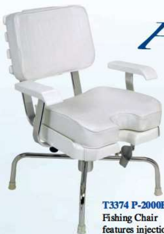
T3374 P-2000F Fishing Chair features injection

molded engineering grade structural resin components, aluminum frame and center gimble. Also available with teak backrest and arm pads.