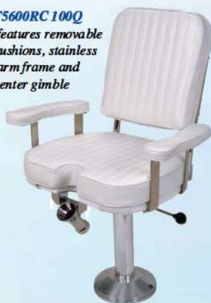
T5600RC 100Q features removable cushions, stainless arm frame and center gimble

Pompanette fishing chairs are perfect for those big game anglers who just don't have the space for a larger fighting chair. Available in pedestal mount or quad base, these are the perfect option on charter boats or as a second or third chair in addition to a large fighting chair.