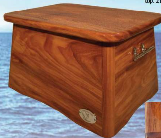
INT1306 21"x18"x13" All teak with clear non skid top. Stainless handles and collapsible bracket to hold lid open.